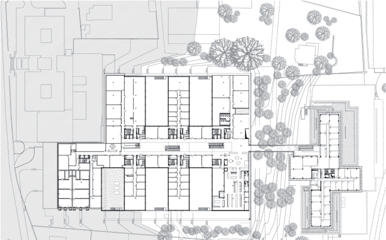
Plan niveau 6